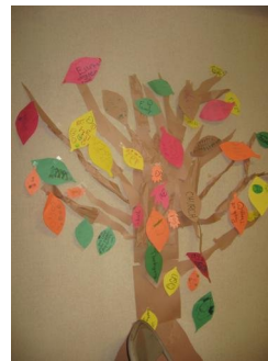
Tree of Thanksgiving